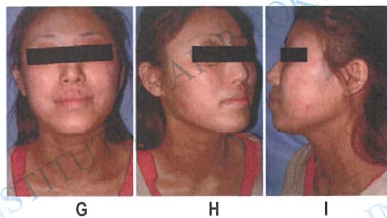
Figure 2. A case involving treatment of the facial surface and neck with ERI lotion, steroid/antibiotic combination ointment and vitamin E/A ointment. (A)-(C): 1 month after treatment; (D)-(F): 1.5 months after treatment; (G)-(I): 3 months after treatment. (A), Front side; (B), Right side; (C), Left side; (D), Front side; (E), Left side; (F), Rear side; (G), Front side; (H), Right side; (I), Left side.