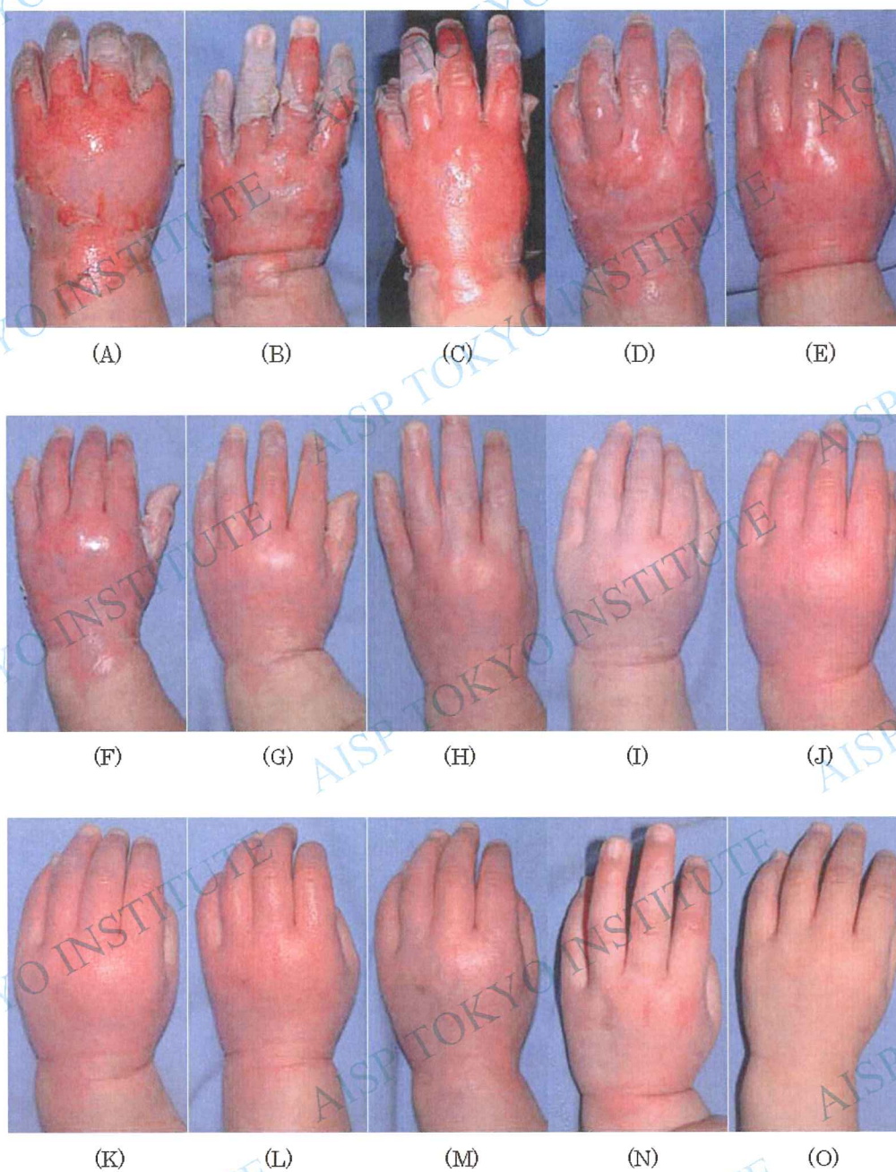
Figure 1. Patient 1: A case involving treatment of the dorsum of the left hand with ERI lotion, antibiotic/steroid combination ointment, and vitamin A/E ointment employing wrap therapy. (A) Before treatment. (B) 2nd day after treatment. (C) 3rd day after treatment. (D) 5th day after treatment. (E) 6th day after treatment. (F) 7th day after treatment. (G) 10th day after treatment. (H) 16th day after treatment. (I) 17th day after treatment. (J) 21st day after treatment. (K) 32nd day after treatment. (L) 44th day after treatment. (M) 74th day after treatment. (N) 98th day after treatment. (O) 130th day after treatment.

wound was considered to have completely healed (Figure 2O).